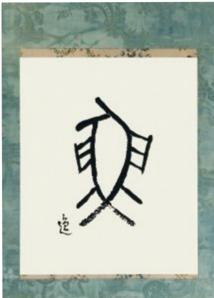
"The Fish" calligraphy by Master Tsuda

7, Cap del Ourm - 09290 Le Mas d'Azil +33 5 61 68 93 13 - kingyo@ecole-itsuo-tsuda.org